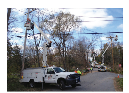
SDG&E crews shown here in Warwick, New York, repaired electric equipment damaged by Superstorm Sandy.