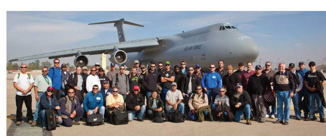
SDG&E crews boarded a U.S. Air Force C-5 cargo plane bound for the East Coast to assist in Superstorm Sandy recovery efforts. Check out their blog at sdge.com/SandyRestoration.

line trucks and aerial bucket trucks. A U.S. Air Force C-5 cargo plane took people and some of the equipment from March Air Reserve Base near Riverside to Stewart Air National Guard Base in New Jersey. Our crews helped New York City utility Consolidated Edison and its subsidiary, Orange and Rockland Utilities, replace electric poles, restring wire and repair circuits serving communities in New York, New Jersey and Pennsylvania.