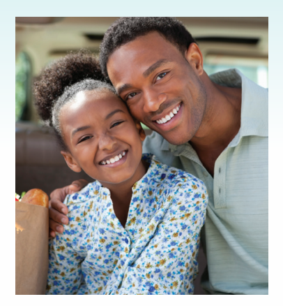
Eniov savings of up to 35% off your SDG&E bill if you qualify for CARE. It's easy to apply at sdge.com/care.

You may qualify if you recently lost your job or meet the income auidelines established for the program. It's easy to apply. Visit sdge.com/care, complete the CARE application enclosed with your current bill, or call 1-877-646-5525 and have your bill handy for account information.